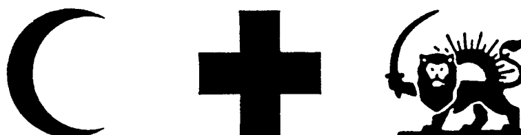
Fig 2. Distinctive emblems in red on a white ground

The distinctive emblem (red on a white ground) shall be as large as appropriate under the circumstances. For the shapes of the cross, the crescent or the lion and sun,* the High Contracting Parties may be guided by the models shown in Figure 2.