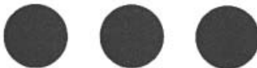
Fig. 5: International special sign for works and installations containing dangerous forces

4. At night or when visibility is reduced, the sign may be lighted or illuminated. It may also be made of materials rendering it recognizable by technical means of detection.